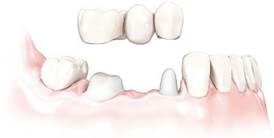
Replacement teeth on natural teeth. Neighboring teeth need to be ground down.

Dental implants are inserted into your jaw bone and act just like the tooth roots of your natural teeth. With this procedure, healthy adjacent teeth are left untouched.