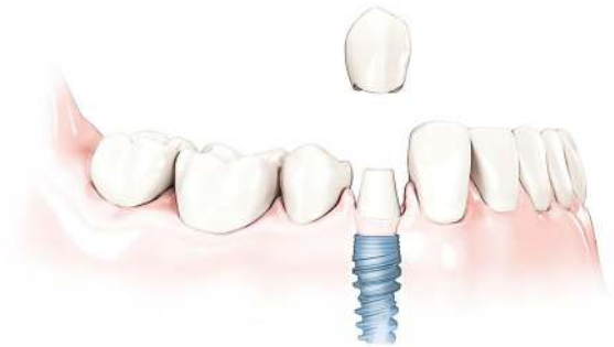
Replacement tooth on implant. Neighboring teeth are left untouched.